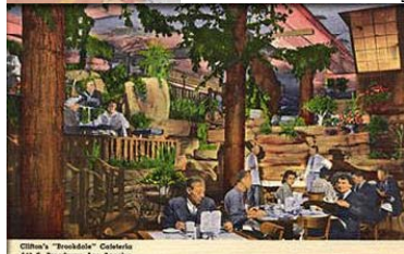
Clifton's "Brookside" Cafeteria 648 S. Broadway, Los Angeles