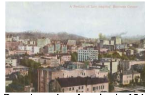
Downtown Los Angeles in 1940s

Bulosan lived at 1026 W. 3 rd St. -- freeway sits over it now.