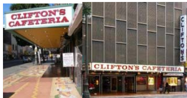
648 South Broadway