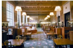
Los Angeles Public Library 630 W. Fifth St.