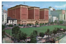
Biltmore Hotel 506 S. Grand Av.